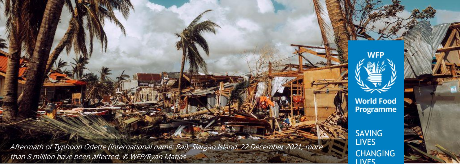
Aftermath of Typhoon Odette (international name: Rai), Siargao Island, 22 December 2021; more than 8 million have been affected.