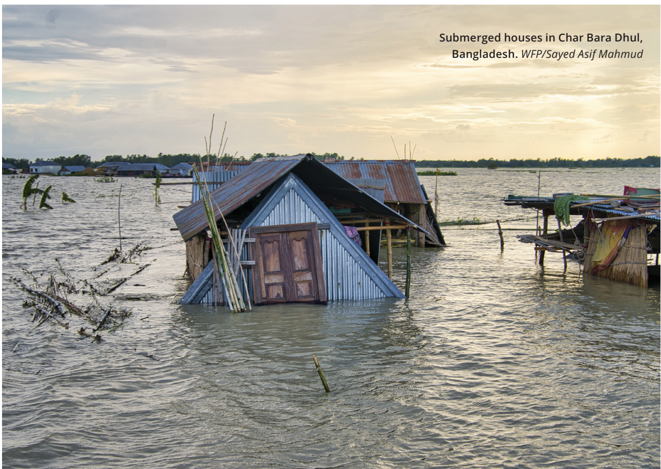
Submerged houses in Char Bara Dhul, Bangladesh.

In 2022, WFP implemented climate risk management solutions in 42 countries, benefiting more than 15 million people. As an experienced risk-manager with extensive programmatic reach, WFP has the field presence and operational readiness to scale up protection against climate impacts for millions of people.