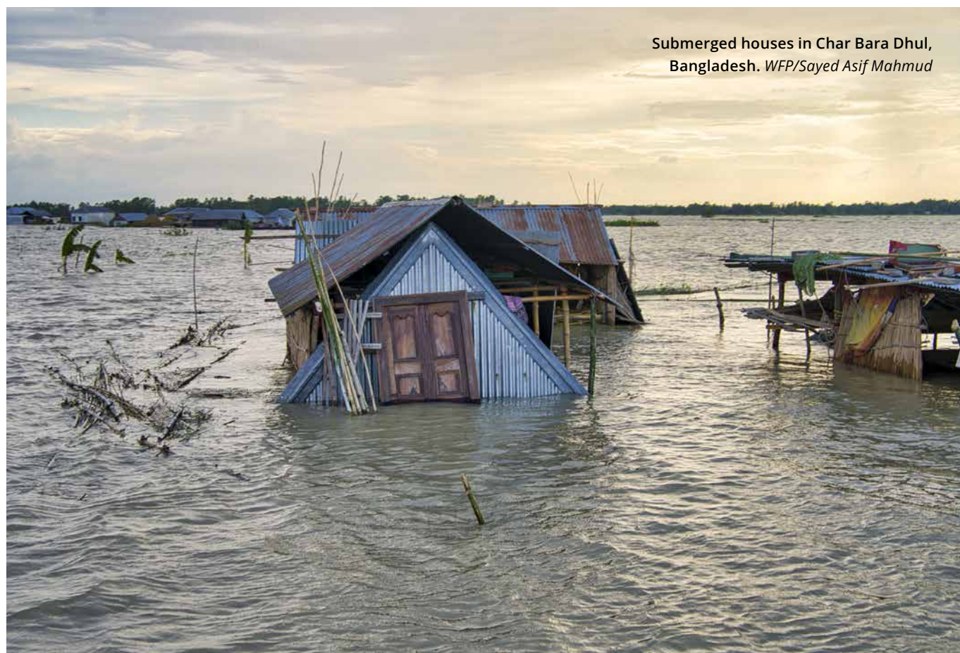
Submerged houses in Char Bara Dhul, Bangladesh.

In 2021, WFP implemented climate risk management solutions in 37 countries , benefiting more than 12 million people . As an experienced risk-manager with extensive programmatic reach, WFP has the field presence and operational readiness to scale up protection against climate impacts for millions of people.