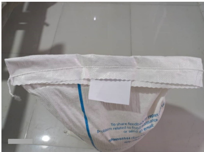
Bags with folded stitching