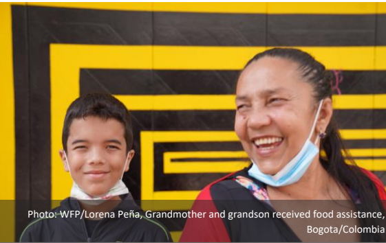
Grandmother and grandson received food assistance, Bogota/Colombia