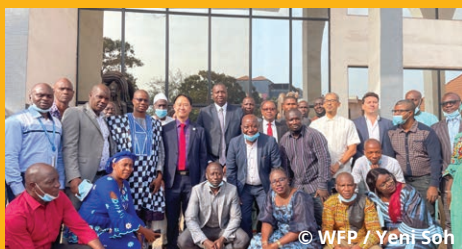
Photo de famille avec le Gouvernement de la République de Guinée, le PAM, le CERFAM et leurs partenaires lors de la validation des résultats de la mission d'évaluation et d'analyse des pertes post-récoltes pour la filière riz