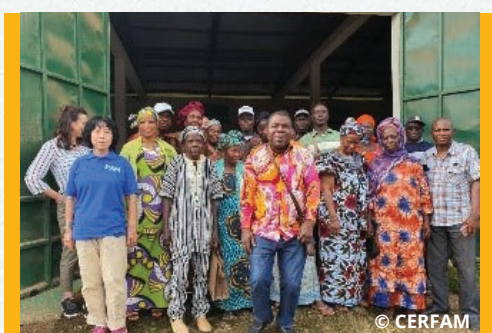
Exchanges took place with producers and stakeholders of the rice sector in the Nzérékoré Region as well as with key stakeholders of the rice sector in Guinea, June 2021.