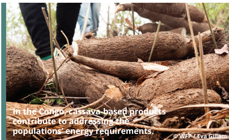
In the Congo, cassava-based products contribute to addressing the populations' energy requirements.

Since 2019, CERFAM has been facilitating the mobilization and deployment of Côte d'Ivoire and Benin's experts to support the Republic of Congo (ROC) farmers to strengthen the weakest links of the national cassava value chain. This initiative has promoted institutional exchanges among the Ministries of Agriculture and Rural Development of these three countries and helped leverage country capacity strengthening efforts by providing training in the fabrication of improved equipment and building of technical skills in the processing processes. This south-south cooperation resulted in increased quantity, better quality of final product, new market opportunities and better skilled smallholder farmers and craftsmen. This gender-transformative initiative has focused on creating a conducive environment for the empowerment of women and youth from the targeted communities and has impacted the daily lives of many households and communities engaged in the process.