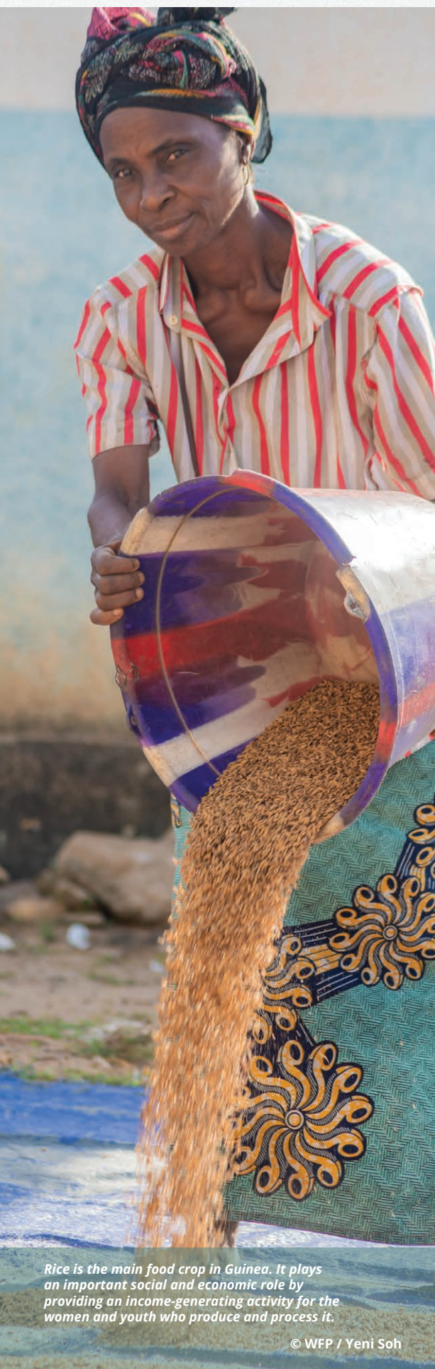
Rice is the main food crop in Guinea. It plays an important social and economic role by providing an income-generating activity for the women and youth who produce and process it.