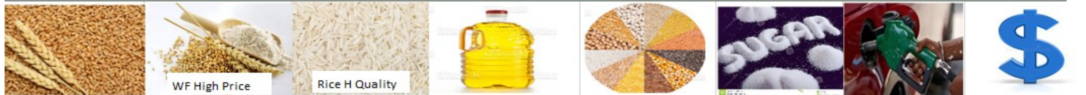
WF High Price