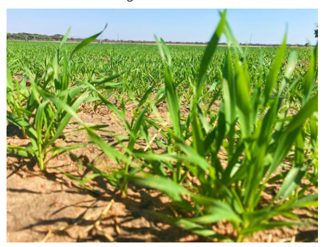
3 weeks old wheat sprouts at Ondera Resettlement Farm.