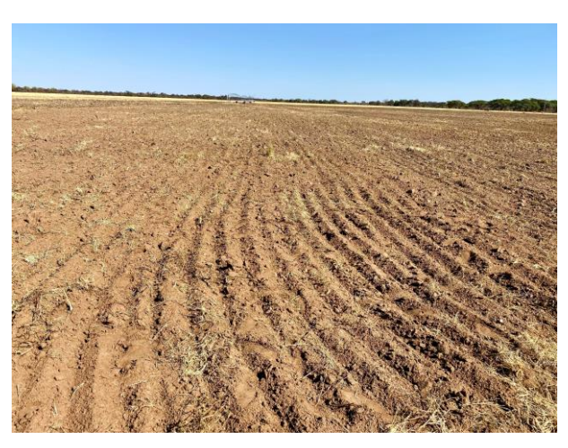
Uncultivated land before planting wheat at Ondera Resettlement Farm.

The implementation of WFP Namibia's 2017 – 2023 Country Strategic Plan, including five budget revisions, is currently being evaluated by an assessment team from its headquarters in Rome. The mission consulted various government stakeholders, UN agencies and donors, e.g., the Ministry of Education, Arts and Culture, the Ministry of Gender Equality, Poverty Eradication and Social Welfare, FAO, UNICEF and the European Union. The consultation aimed to garner insights on internal and external processes, experiences, successes, challenges and learning outcomes between WFP and its stakeholders to inform the design of its new Country Strategic Plan.