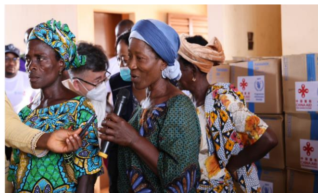
Photo: Beneficiaries expressing their gratitude at the launching ceremony at Adjohoun.