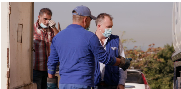
WFP staff are ensuring fuel is delivered to facilities in need.

Between September 2021 and March 2022, WFP led the operation to supply Lebanon's health and water facilities with fuel to ensure their continuity amid a severe electricity crisis. WFP contracted and procured fuel through two of the largest fuel companies in the country and arranged all necessary logistics supply chain and monitoring of the operation from the fuel terminal to the final delivery points in urban and remote areas. At the end of the project, WFP successfully delivered more than 10 million litres of fuel to 600+ health and water facilities in all 26 districts in Lebanon.