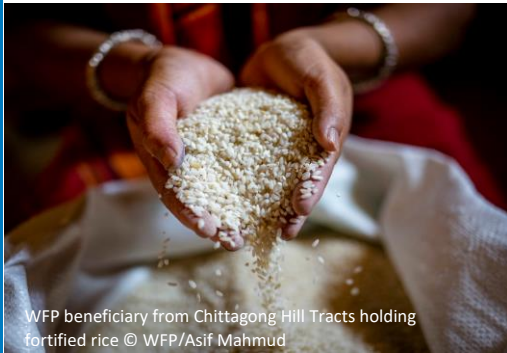
WFP beneficiary from Chittagong Hill Tracts holding fortified rice