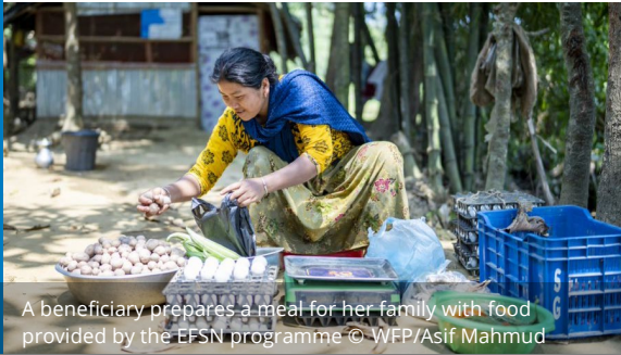
A beneficiary prepares a meal for her family with food provided by the EFSN programme