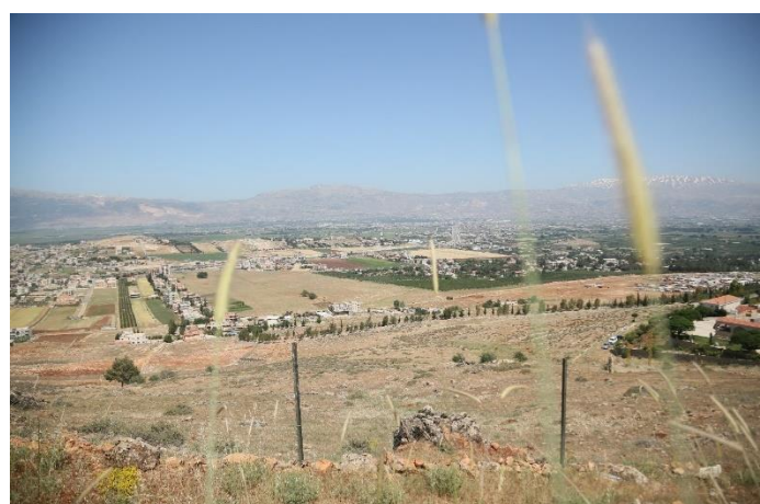
The scenic Majdel Anjar, where participants in WFP livelihoods projects planted trees through the 'One Million Trees' initiative.

Through its Food for Assets projects, WFP works to build individual resilience and livelihoods while also supporting the work to increase Lebanon's greenery and build community resilience to climate change.