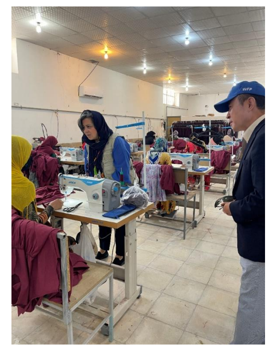
Photo caption: H.E. Yun Kang-Hyeon, the Ambassador of the Republic of Korea had an opportunity to interact with refugees.

Australia, Germany, Japan, The people's Republic of China, the Republic of Korea, the United Kingdom, multilateral funds, and private donors.