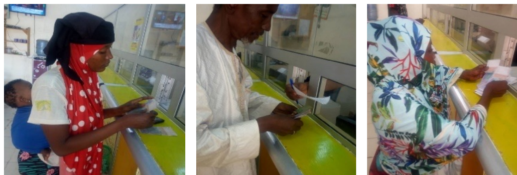
Recipients collecting transfers from BNIF in northern regions of Niger. COVID-19 precautions did not include obligatory wearing of masks at that time.