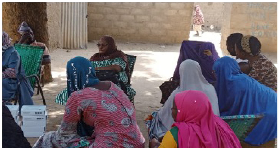
Sensitization and health screening in Madarounfa Region of Maradi