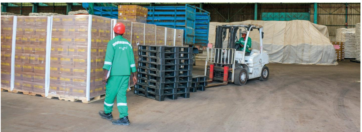
The 8,500 meters square M29 with a storage capacity of 18,000 MT