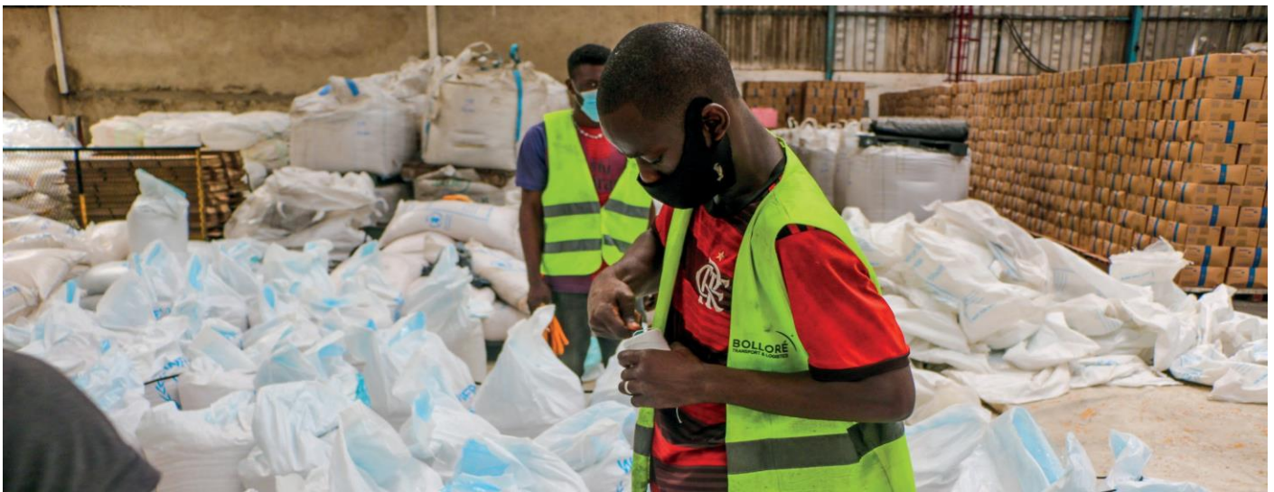
The 6,500 meters square CC2 warehouse with a storage capacity of 13,000 MT

Commodities received at the port are temporarily stored in two bonded warehouses managed through a third party contracted by WFP. They are then transported to the recipient countries, mostly by road, and WFP warehouses in the regions in Cameroon where WFP operates.