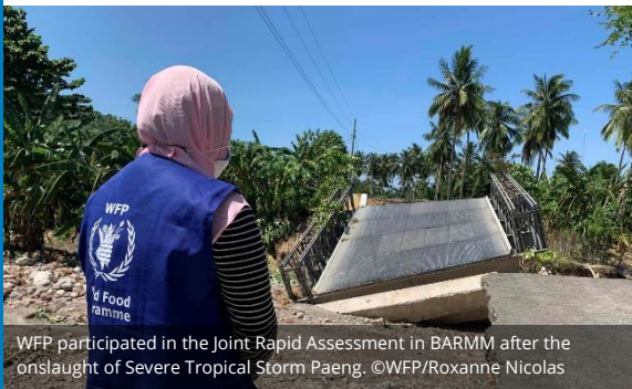
WFP participated in the Joint Rapid Assessment in BARMM after the onslaught of Severe Tropical Storm Paeng.