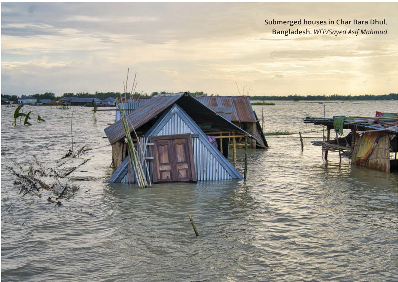
Submerged houses in Char Bara Dhul, Bangladesh.

In 2022, WFP implemented climate risk management solutions in 42 countries, benefiting more than 15 million people. As an experienced risk-manager with extensive programmatic reach, WFP has the field presence and operational readiness to scale up protection against climate impacts for millions of people.