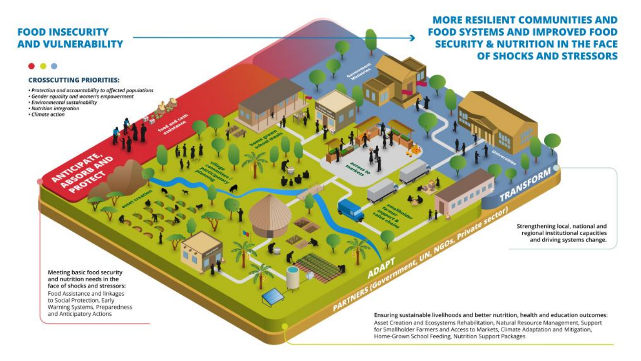
Fig. 1: Illustration of the Sahel Integrated Resilience approach

In this context in 2018, WFP and the governments of Burkina Faso, Chad, Mali, Mauritania and Niger launched the "Sahel Integrated Resilience Programme", a large-scale innovative and integrated programme to boost resilience and adaptation of communities to ecosystem degradation, climate change and other vulnerabilities.