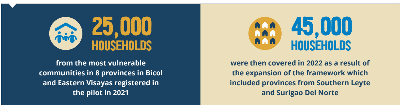
Figure 2: Anticipatory Action by the numbers.

One of the principal benefits of the pilot AA framework to date is that it has allowed the AA model to be tested at scale and with the coordinated involvement of all key United Nations agencies. This has generated robust proof of concept for the mainstreaming of AA within the United Nations and government disaster risk management systems.