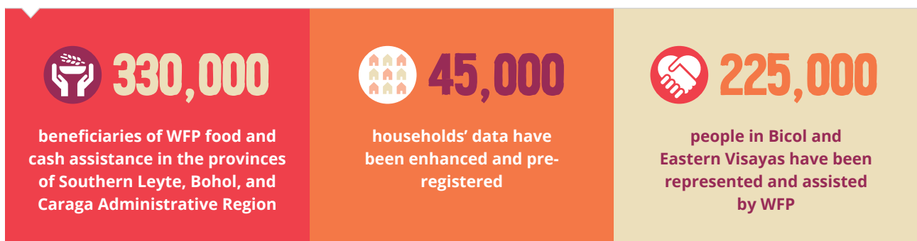
Figure 2: SCOPE by the numbers.

WFP also used SCOPE in several emergency operations to register and distribute food and cash assistance to affected households. From late 2020 to early 2021 it was employed to provide cash assistance to victims of typhoons Goni and Vamco. Following the arrival of Typhoon Rai in December 2021, WFP uploaded thousands of profiles to SCOPE and helped deliver food and cash assistance to more than 330,000 beneficiaries in the provinces of Southern Leyte and Bohol as well as the Caraga Administrative Region. SCOPE has also been used to pre-register and enhance data for 45,000 households, representing 225,000 people, in Bicol and Eastern Visayas, allowing them to receive WFP assistance in advance of forecasted category 3, 4 or 5 typhoons.