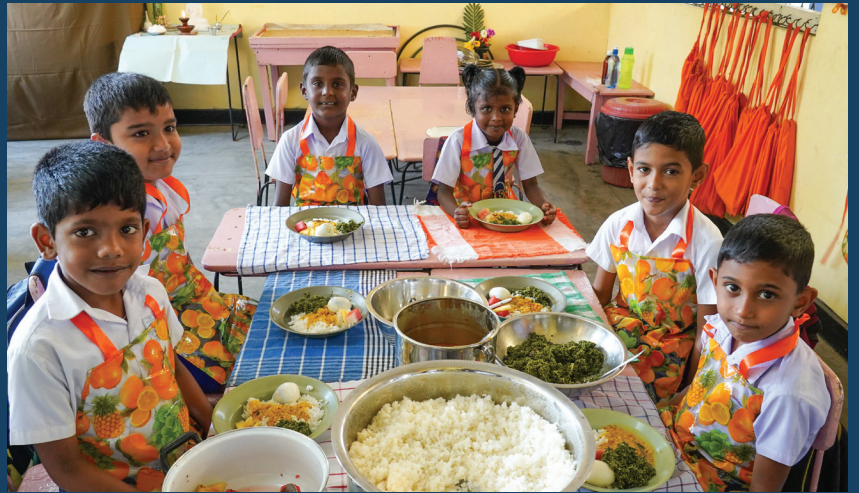
Primary grade students of St. John's Maha Vidyalaya, Mattakkuliya, enjoying their morning meal made with rice provided through WFP.