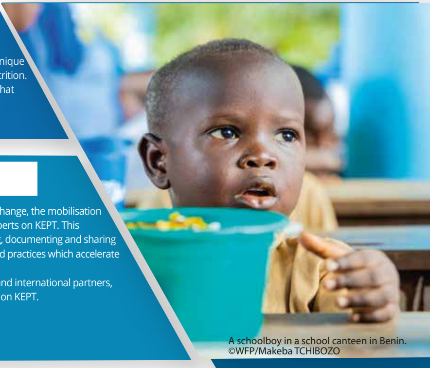
A schoolboy in a school canteen in Benin.

The process of submission and review of good practices involves national and international partners, national institutions, UN agencies, NGOs and civil society and is carried out on KEPT.