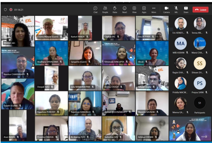
Panel discussion on Breaking Barriers Gender Equality through Digital Innovation hosted by WFP India.

An interactive panel discussion- Breaking Barriers Gender Equality through Digital Innovation was hosted online. Speakers from organizations like Gram Vaani, Feminist Approach to Technology, EXL Services and Digital Empowerment Foundation talked about the importance of digital literacy for women for financial, social and economic empowerment; challenges that women face due to lack of access and opportunities that can be created to promote women's leadership.