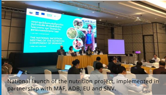
National launch of the nutrition project, implemented in partnership with MAF, ADB, EU and SNV.