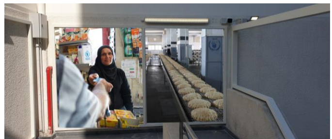
Photo 1: cultivated land near WFP-rehabilitated irrigation system in east Maskaneh /Aleppo governorate