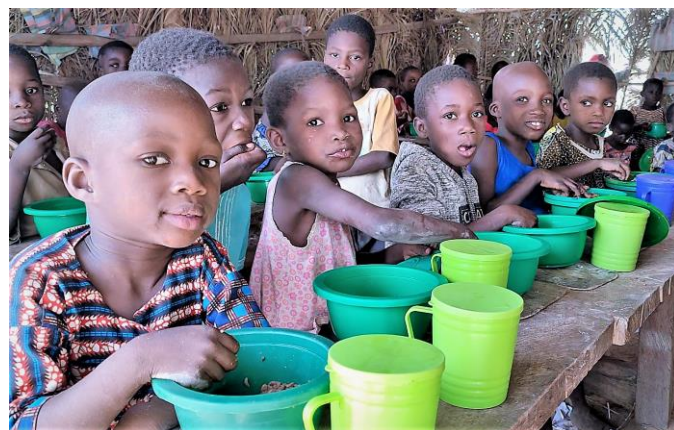
Hot meals for pupils at Leon-Yaka elementary school. Commune of Doufelgou 2, Kara Region of Togo.