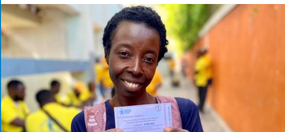
Cash distribution as part of WFP's emergency activities in the Port-au-Prince metropolitan area