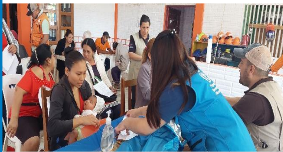
Cash distribution in the Bolivian Amazonian Basin