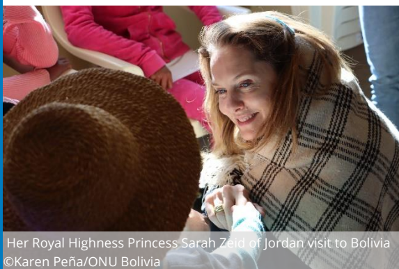
Her Royal Highness Princess Sarah Zeid of Jordan visit to Bolivia