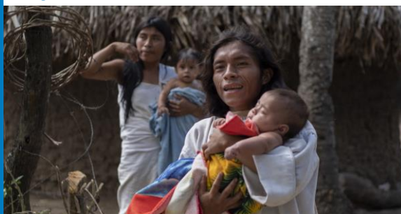
People from the Indigenous Arhuaco community receiving assistance, Sierra Nevada de Santa Marta (Colombia)