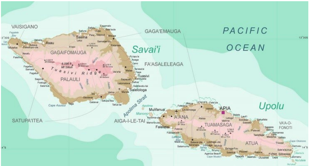
Figure 1: Map of Samoa