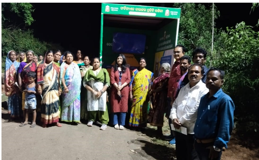
Officials and community members attending an awareness session as part of WFP's Social Behaviour Change Campaign on fortified rice.

WFP also hosted a state-level stakeholder workshop in Bhubaneswar, Odisha, on 27 June, with participants from various departments and organisations such as UNICEF, UNDP, Azeem Premji Foundation, Deloitte, and UN Women.