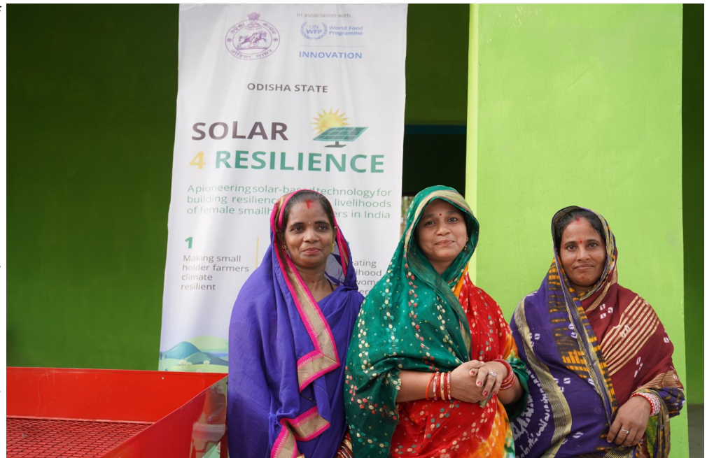
Women self help group members at the lunch of the Solar for Resilience initiative at Ganjam, Odisha

One of the project's key features is the provision of solar-drying technology to women, which they can use to dry vegetables, millet, fish/seafood, and other perishable food that would otherwise go to waste. The women can purchase the equipment with low-interest loans from banks and receive financial management and quality assurance training.