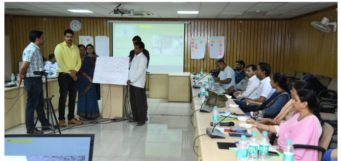
Officials from the Directorate of Evaluation Organization (DEO) and Directorate of Economics and Statistics, Government of Rajasthan at the workshop on Output Outcome Monitoring Framework conducted by WFP India.

This workshop is part of a larger MoU signed between the Government of Rajasthan and WFP and a Letter of Understanding signed between the Planning Department, the Government of Rajasthan, and WFP in October 2020. WFP has conducted five training programs so far for DEO officials to enhance their knowledge and expertise in monitoring and evaluation.