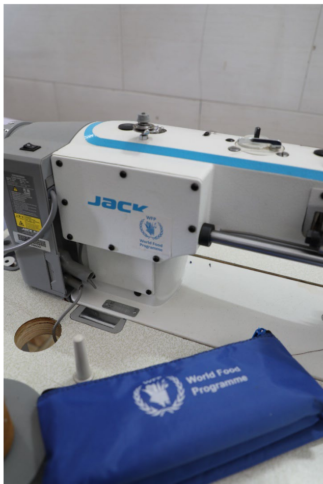
Photo caption: WFP Iran successfully implemented 39 livelihood projects including 30 income-generating activities and two training centres inside settlements. The picture was taken in Yazd bag-making workshop for young refugee women.

Australia, Germany, Japan, the People's Republic of China, the Republic of Korea, the United Kingdom, multilateral funds, and private donors.