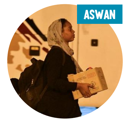
The humanitarian corridor serves as a passageway for UN agencies, and humanitarian partners to deliver assistance across the Sudan-Egypt borders.

Through the humanitarian corridor, WFP delivered 50 metric tons of fortified emergency food from Egypt to Sudan to support those affected by the crisis.