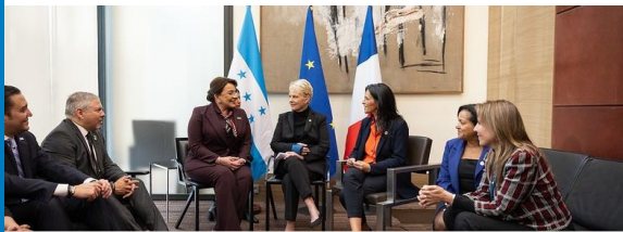
Meeting between the President of the Republic of Honduras, the Minister of State for Development of France, WFP Executive Director and WFP Honduras Country Director.