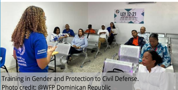
Training in Gender and Protection to Civil Defense.