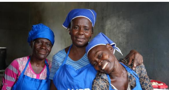
Three parent volunteers who prepare daily meals at Ecole Nationale Desronville in Gonaïves