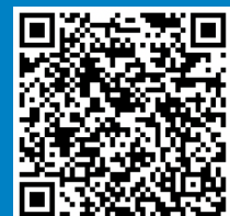
Report: Reduction in humanitarian needs