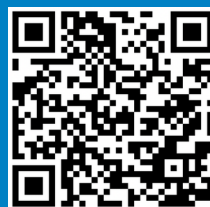
Video 1 (Chad)