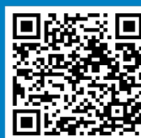
WFP Website on Resilience

Scan the code to learn more about WFP's integrated resilience programme and how it contributes to reducing humanitarian needs.