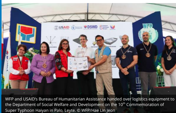
WFP and USAID's Bureau of Humanitarian Assistance handed over logistics equipment to the Department of Social Welfare and Development on the 10 th Commemoration of Super Typhoon Haiyan in Palo, Leyte.