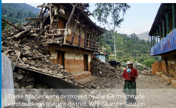
These houses were destroyed by the 6.4 magnitude earthquake in Jajarkot district.