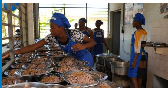
Distribution of locally-sourced school meals in Miragoane.