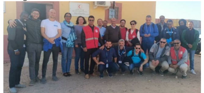
Photo Caption: WFP and partner participants in monitoring and distribution cycle workshop

WFP, UNHCR, Algerian Red Crescent, and the Sahrawi Red Crescent (MLRS) held a three-day workshop in early December in Rabouni to review current assistance distribution and monitoring processes; ways of improvement and strengthening beneficiary identity management.