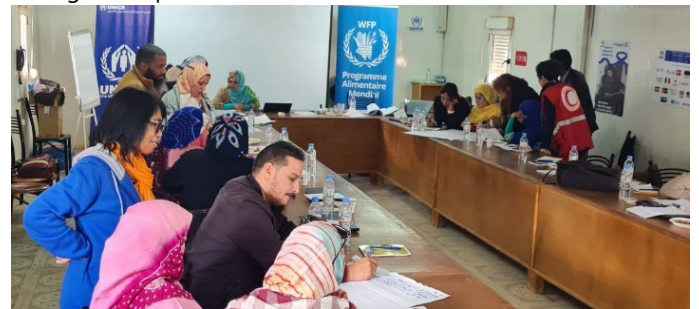
Photo Caption: Training session for the cooperating partners in the Sahrawi refugee camps.

As part of the 16 days of Activism, the fight against violence against women and girls continues to be an everyday duty to all WFP staff. Under the year's theme , WFP Algeria organized GBV awareness-raising sessions with women and men from the refugee population on the principles and root causes of GBV and its effect on individuals, households, and communities. Additionally, jointly with UNHCR, WFP facilitated a training session for cooperating partners in the camps with particular focus on Sexual Exploitation and Abuse during the implementation of assistance interventions.