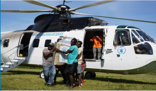
UNHAS helicopter delivers boat motor for emergency transport on Ile de la Tortue.