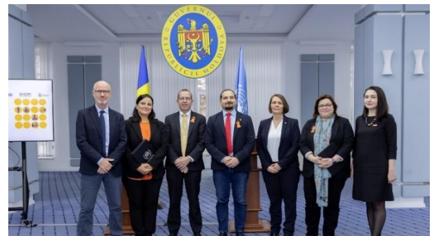
Minister of Labour and Social Protection, Alexei Buzu, and heads of UN agencies supporting the programme for vulnerable Moldovans and social protection capacity strengthening

This initiative provides immediate cash assistance to over 67,000 people, including 56,236 pensioners, over 3,000 families caring for children with severe disabilities, more than 7,000 families with disabled members, and over 1,000 pregnant or breastfeeding women with children