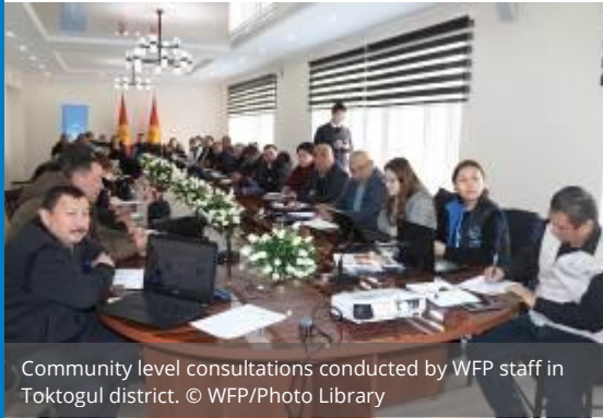
Community level consultations conducted by WFP staff in Toktogul district.