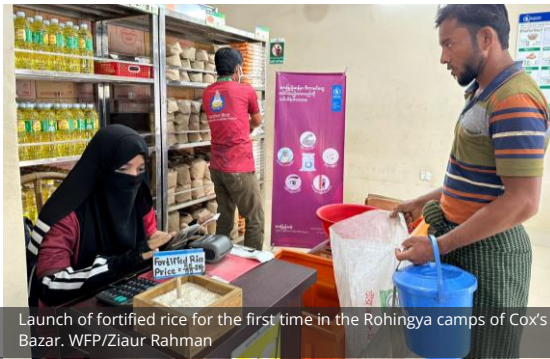
Launch of fortified rice for the first time in the Rohingya camps of Cox's Bazar.