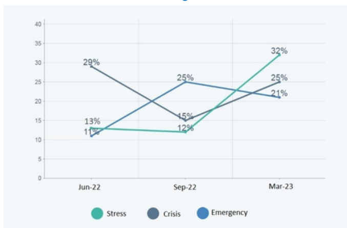
Percentage of households resorting to coping strategies

Stress strategies, such as borrowing money or spending savings in June 2023 showed a significant - 20% increase in comparison with September 2022. Prolonged use of this strategy may affect the ability of households to deal with future shocks negatively as it could result to the increased debts.