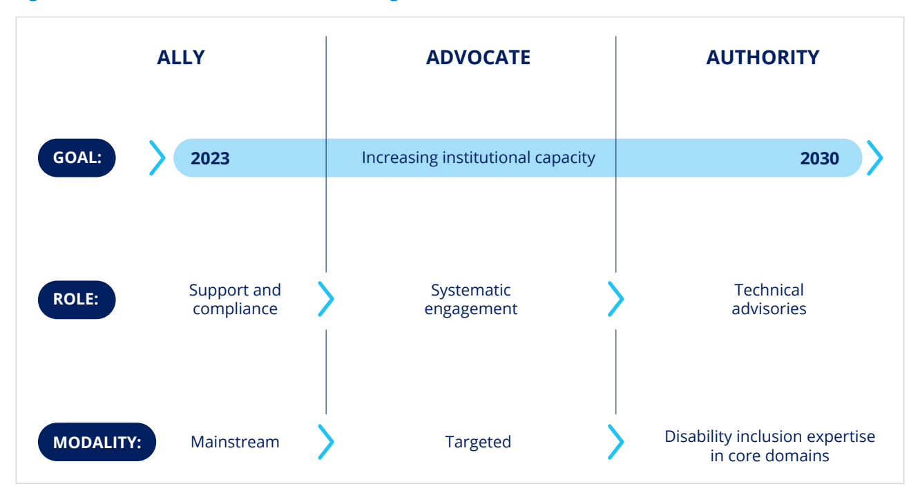
Figure 1. Potential direction of institutional change