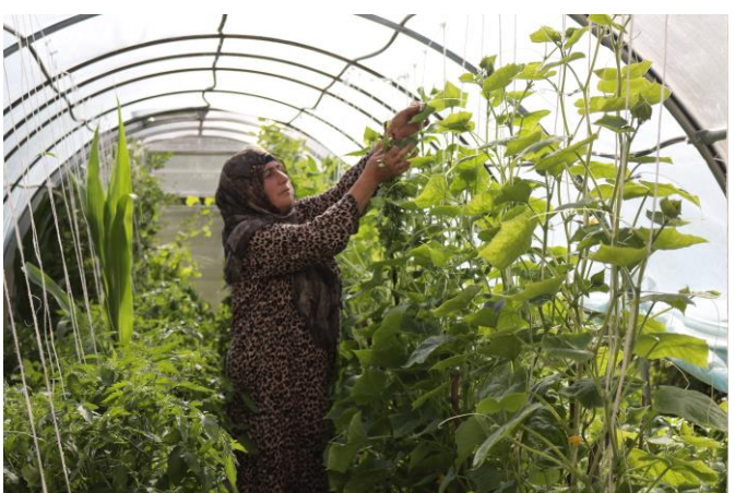
WFP provides greenhouses also to food-insecure women to better meet their food needs.

WFP issued <u>regular updates</u> on the Tajikistan market situation that were widely shared with partners and donors.